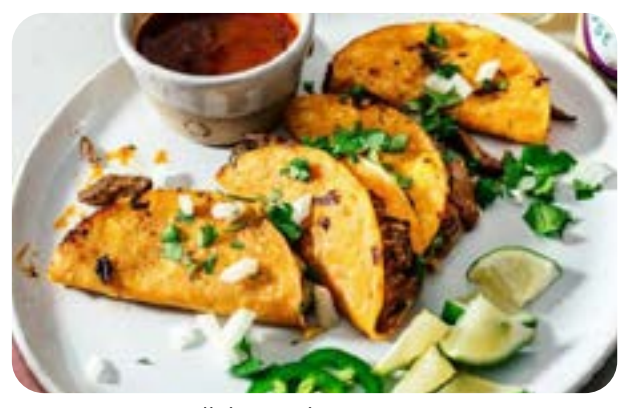
La Delicia Mexican Restaurant