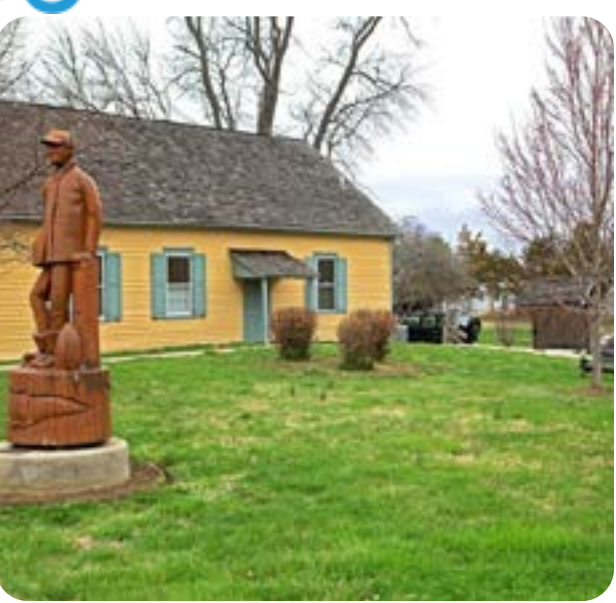
Port Penn Interpretive Center