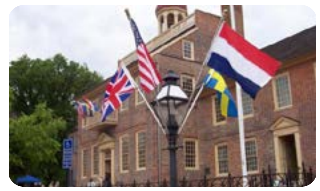
New Castle Courthouse