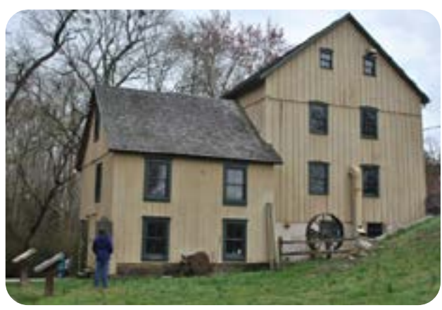
Abbott's Mill Nature Center