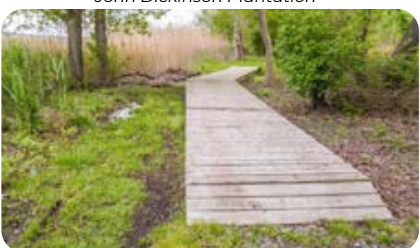
St. Jones Reserve

St. Jones Neck is the site of one of the state's earliest English settlements. Today, the beauty of the agricultural lands surrounding the wildlife areas offers you opportunities for history, heritage and natural resource discoveries.