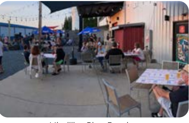
Mispillion River Brewing