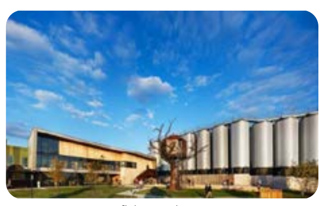
Dogfish Head Brewery