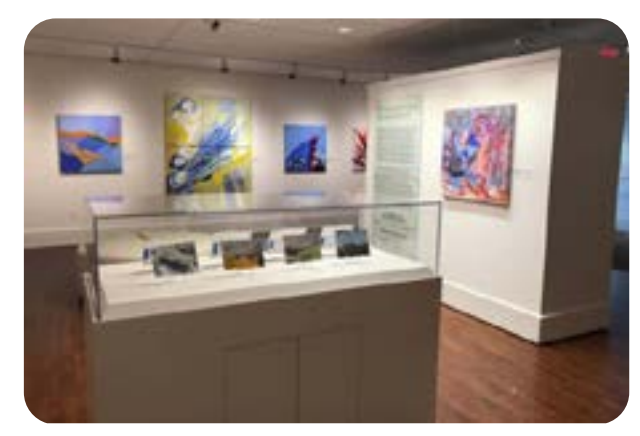
Biggs Museum of American Art