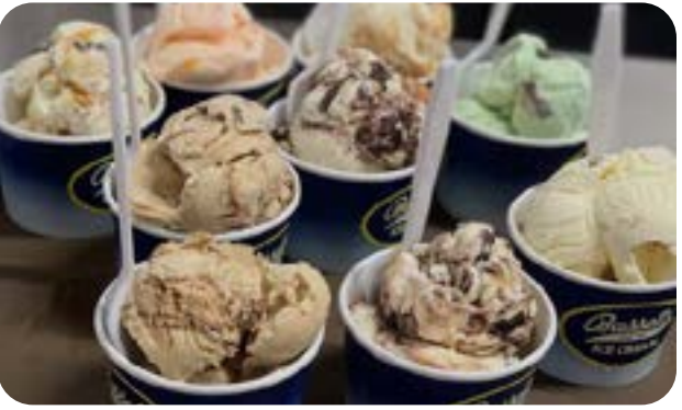
DE Turf Sports Complex