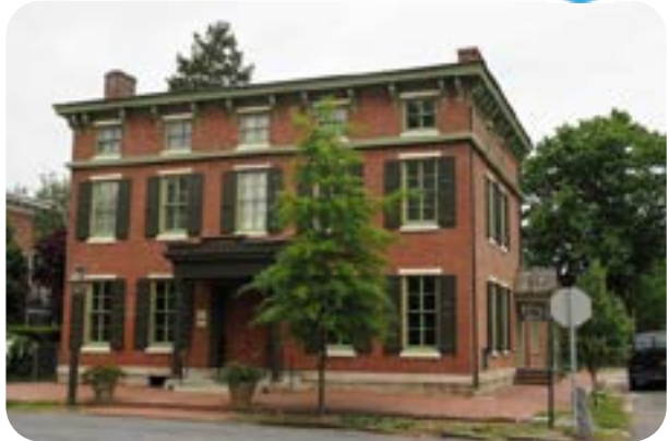
Historic Odessa Foundation