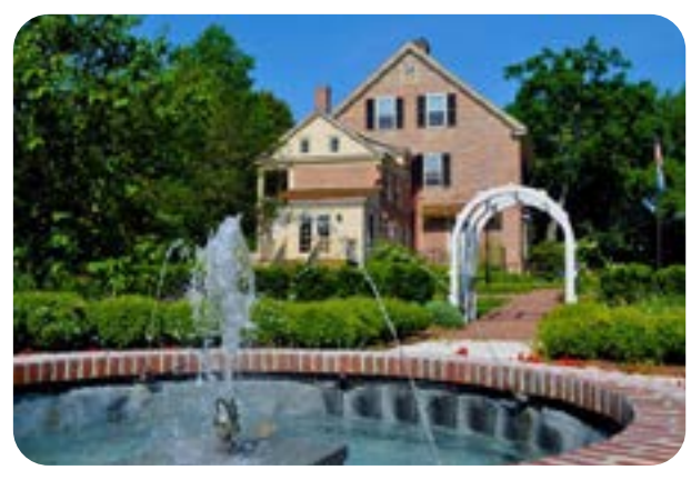
Woodburn: The Governor's House