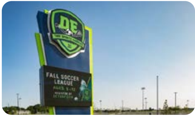
DE Turf Sports Complex