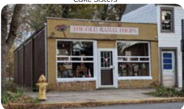
Old Canal Shops

Take Route 9 from historic New Castle to Delaware City. This stretch of the Bayshore Byway provides the most drastic change in landscape features as the quaint colonial city gives way to industrial complexes, and finally marshland. Delaware City is a small riverfront town with a downtown commercial district featuring shops and restaurants. From here visitors can catch a ferry over to Fort Delaware, located on Pea Patch Island in the middle of the Delaware Bay, embark on the 8.7 mile Mike N. Castle C & D Canal Trail, or visit the American Birding Association at the historic Sterling Hotel. Just across the canal is Fort DuPont State Park. Continuing down Route 9 the landscape flattens out to the low lying marshland of the Augustine Wildlife and Ashton Tract Wildlife Area.