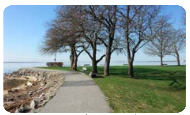
New Castle Battery Park